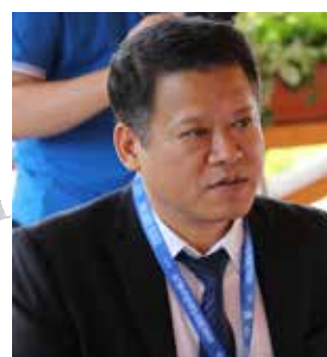
Asia's special delegate - NghiemXuan Dong;