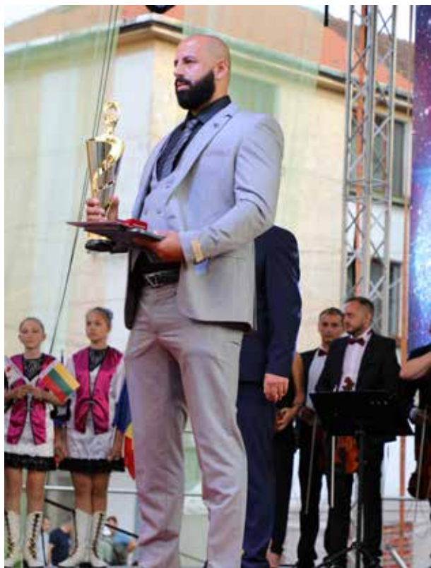
Salih Shami (State of Israel)